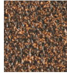
Canyon Spice (26)